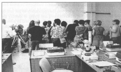
Fig. 2. Practice in analyzing the photographs.

So, the first week was dedicated to the Chemistry and the Methods available for Identification of the Old Photographic Processes. The presented lectures become the theoretical background for the next step: the series of tests and analyses intended to set up the individual experience in approaching the issues.