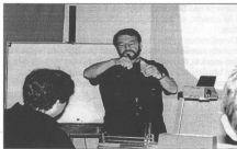
Fig. 3. Prof. Dusan Stulik explaining the Silver Chemistry details.

The strange chemistry of Silver and its light-sensitivity, the importance of halides and binding media, the alternatives in image construction (the Non-Silver processes), were important topics, also because of some laboratory demonstrations.